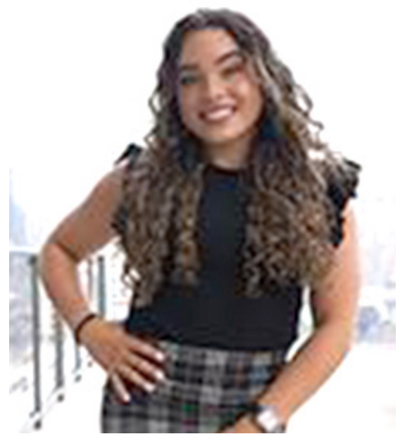
The Widener Board of Trustees has

There's also <u>an advice section</u> for families offering tips from members of the Widener community who have a student in higher education.