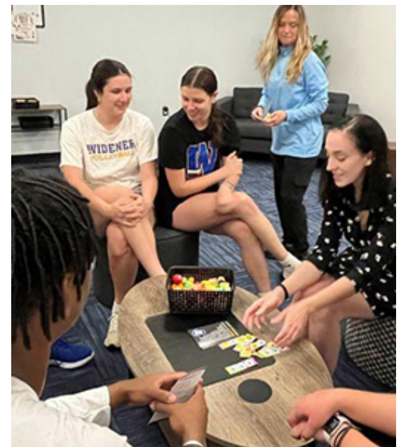
Widener University's Counseling and Psychological Services and Athletics departments have teamed up to create <u>a</u> <u>new resource for athletes to support</u> <u>mental health and wellbeing.</u>

Have you checked out the Widener families section of our website? Read up on talking to your student about <u>mental health</u>, supporting their <u>academic</u> <u>success</u>, and <u>being a good roommate or neighbor</u>.