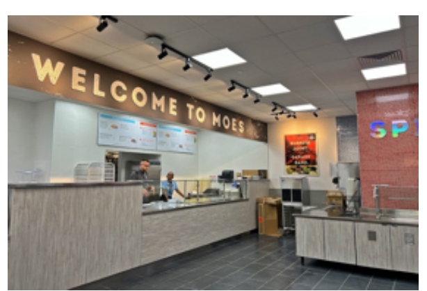
It was a summer of <u>significant campus</u> <u>renovations and refreshes</u>, all designed to improve the living and learning experience for students, faculty, and staff.