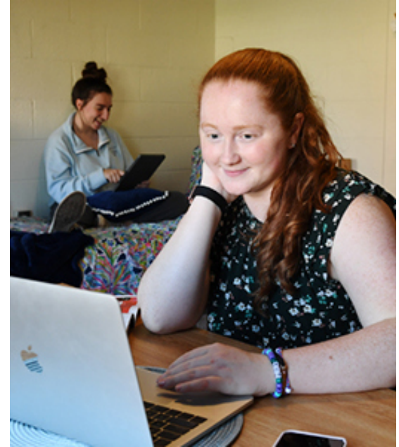
First Year Experience Coaches offer oneon-one, personalized coaching as a part of our students' first-year experience. They will give incoming students strategies and tools to get the most from their education and experience at Widener.